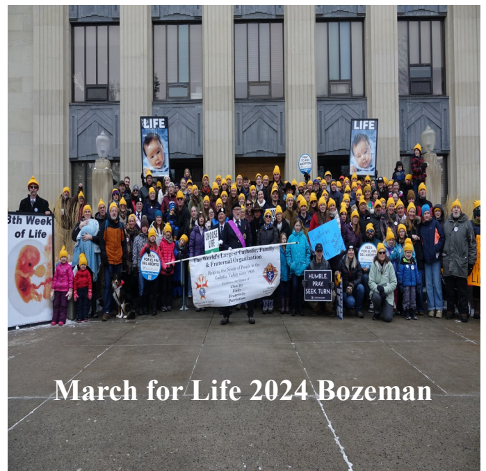
March for Life 2024 Bozeman