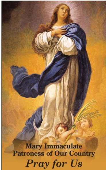
Mary Immaculate Patroness of Our Country Pray for Us